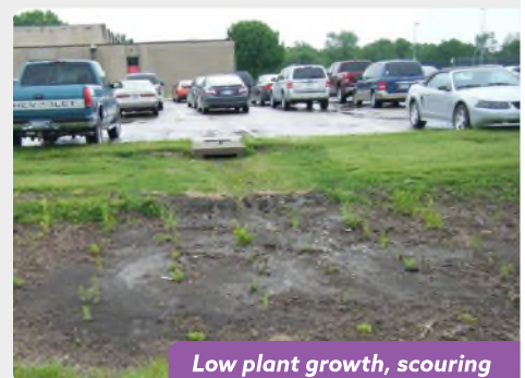
Low plant growth, scouring