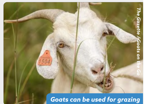
Goats can be used for grazing