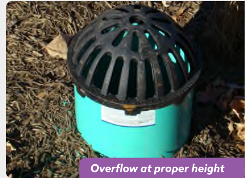
Overflow at proper height