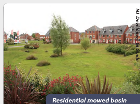
Residential mowed basin