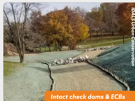
Intact check dams & ECBs