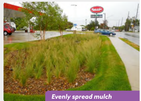
Evenly spread mulch