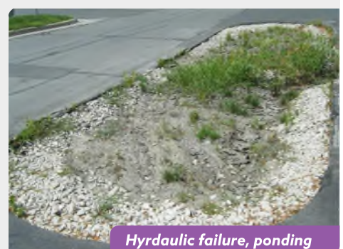
Hydraulic failure, ponding