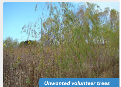
Unwanted volunteer trees