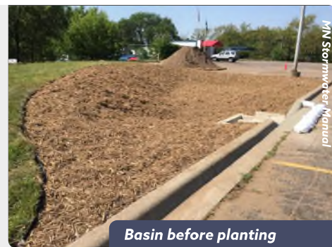
Basin before planting