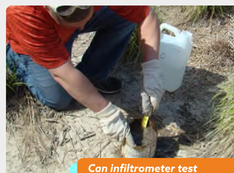
Can infiltrometer test