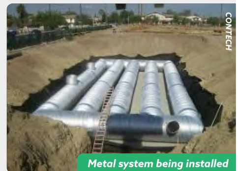
Metal system being installed