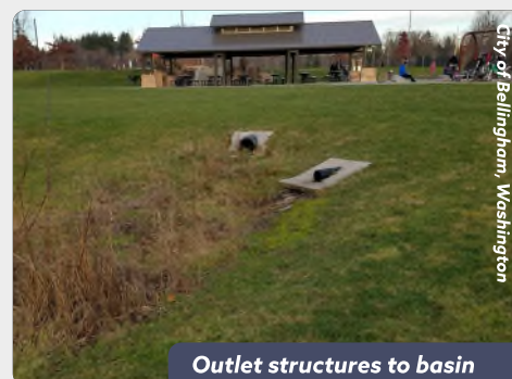
Outlet structures to basin