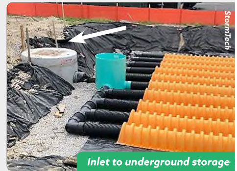
Inlet to underground storage