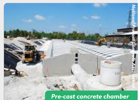
Pre-cast concrete chamber