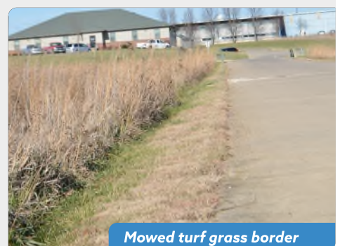
Mowed turf grass border