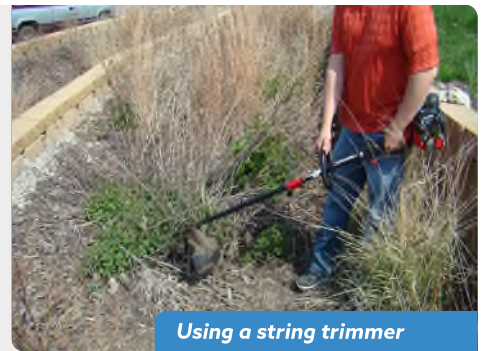
Using a string trimmer