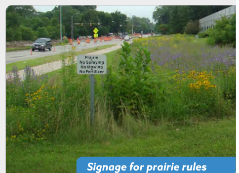
Signage for prairie rules