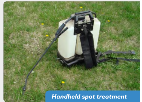
Handheld spot treatment