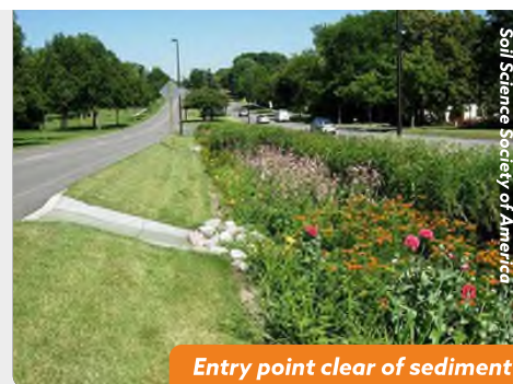
Entry point clear of sediment

Function - Water Infiltration. Replace modified soil layer when ponding greatly exceeds the design drainage time. In some cases, removing and replacing the upper few inches of soil may resolve the issue. A can infiltrometer tests can be performed using a can on the soil surface with the addition of water to observe drainage times.