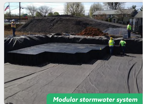
Modular stormwater system