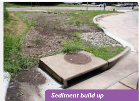
Sediment build up

Erosion. Fix any erosion immediately. Take measures to stabilize erosion along drainage paths.