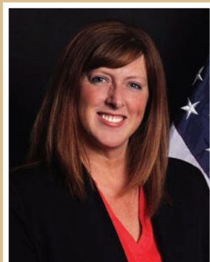
Mayor Courtney Clarke