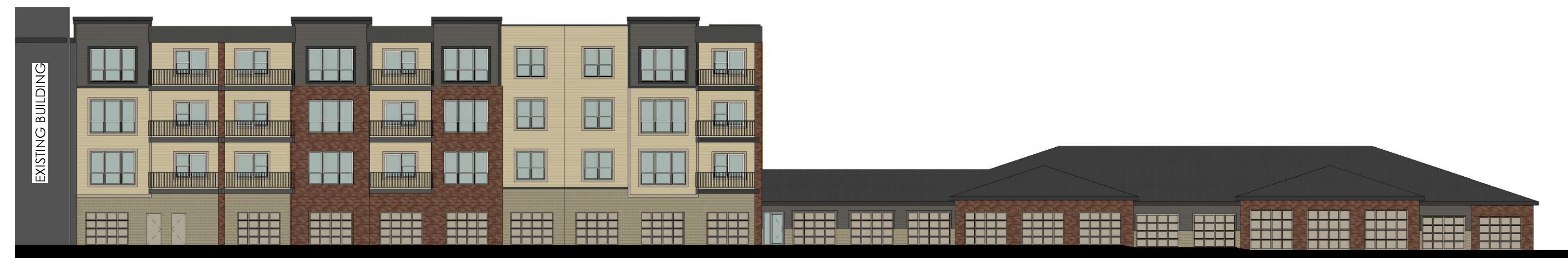
④ East Elevation 1/16" = 1'-0"