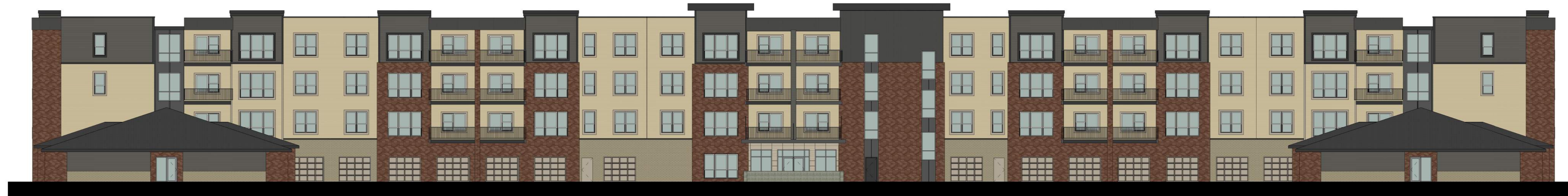
① North Elevation 1/16" = 1'-0"