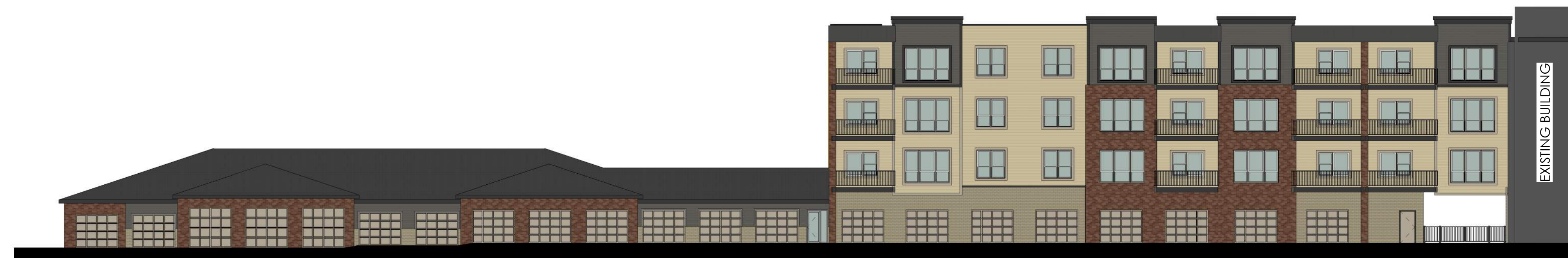
③ West Elevation 1/16" = 1'-0"